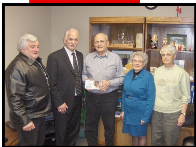
On March 5, Development and Peace members met with Conservative MP Vic Toews to present him with over 300 Fall Action cards.